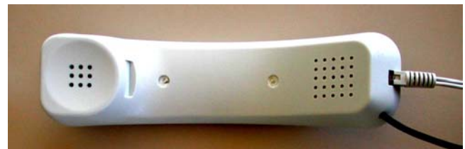
Figure 1: the ear-sensing handset.

In the following sections, we examine some implementation details, and discuss our results with a prototype system.