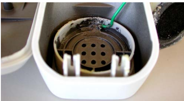
Figure 3: the ear electrode (speaker removed).